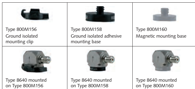
Fig. 1: Mounting accessories

Reliable and accurate measurements require that the mounting surface be clean and flat. The instruction manual for the Type 8640A... series provides detailed information regarding mounting surface preparation.