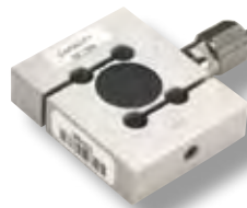
Shown: SLC Sensor attached to the Chatillon DFS-R-ND gauge.