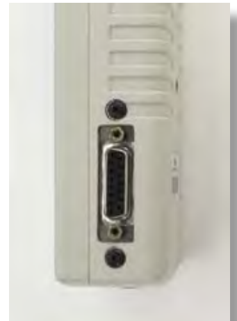
Shown: Sensor connection port on the Chatillon DFS-R-ND Series gauge.